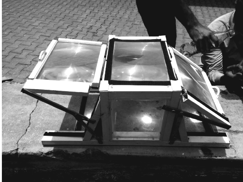
Figure 4: Actual Setup Arranged at 12 Noon